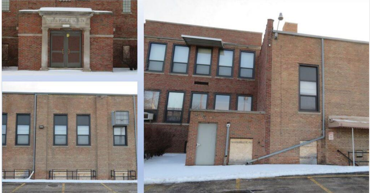
Exterior of building

With this move, Walsh Academy is progressing from CTE courses, which simply make learning more accessible, to providing Trade focused CTE courses, which create pathways for more than 100 students to pursue Apprenticeships and high-paying, high-demand careers in various skilled Trades.