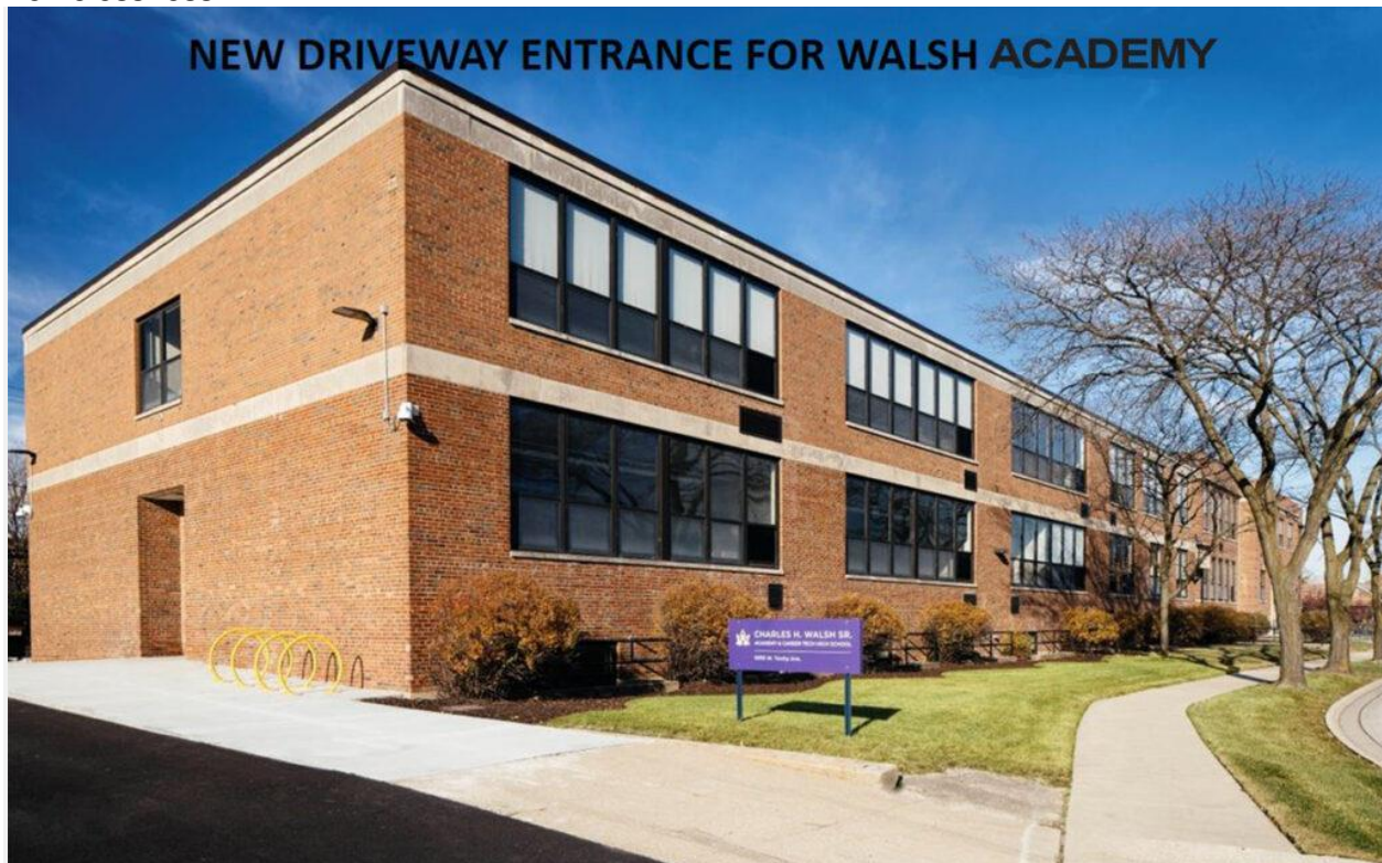
New driveway entrance for Walsh Academy

Students attending Jen School, now the Charles H. Sr. Academy & Career Tech High School, (Walsh Academy) have one or more significant challenges, such as specific learning and emotional disabilities, Autism or other health impairments, which negatively impact their ability to learn in traditional settings with traditional instructional models. In addition, many of these students have experiences of childhood trauma such as neglect, abuse, abandonment and homelessness.